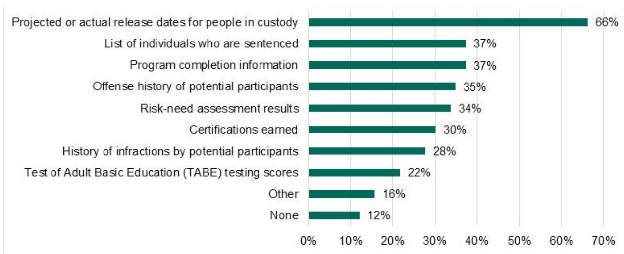
Exhibit 2. Information provided by facility partners to Pathway Home grantees as reported by survey respondents